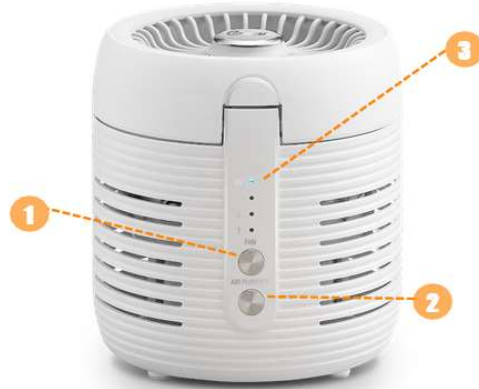
Fig. 2 (Main)